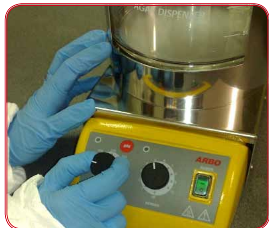
6) Dispensing temperature setting