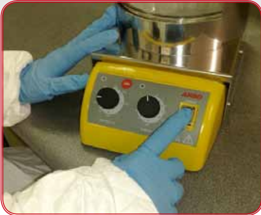
7) Switching on the unit