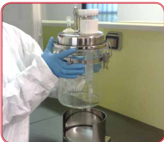
5) Transfer of the Agarfill in the Agarfill System and apply the sterilized tubing and tip to the outlet of the container