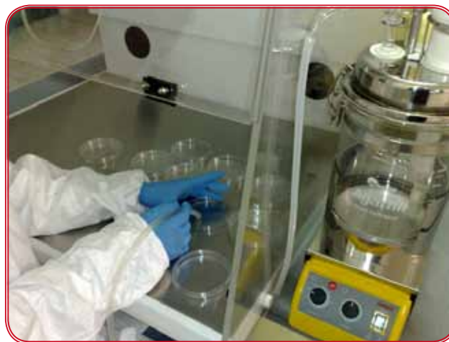
11) Sterile medium dispensing into Petri dishes, etc.