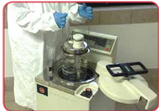
4) Recover of Agarfill at the end of sterilization cycle