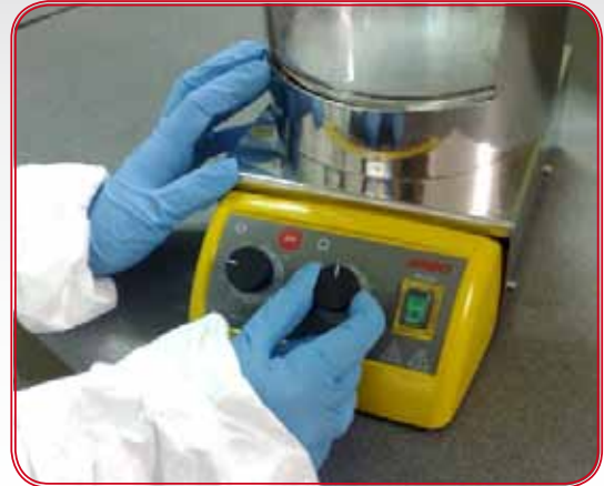
8) Medium mixing setting