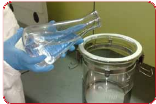
2) Adding water to Agarfill container