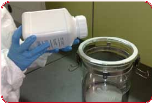
1) Adding power medium to Agarfill container