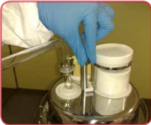
9) Dispensing volume setting