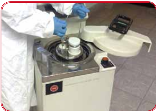
3) Transfer the Agarfill to autoclave for sterilization